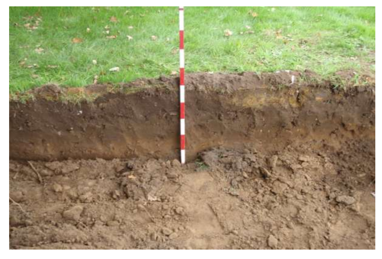
Plate 4. Section on east side