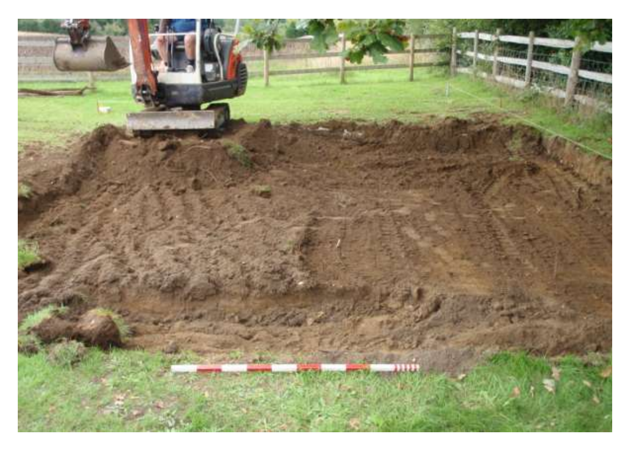
Plate 3. The site showing removal of topsoil (looking west)