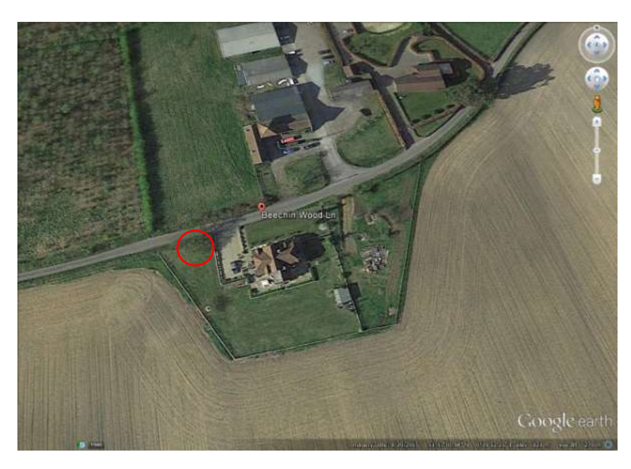
Plate 1. Aerial view of site (red circle) showing the site prior to development.

(Google Earth 20/04/2015: Eye altitude 270m).