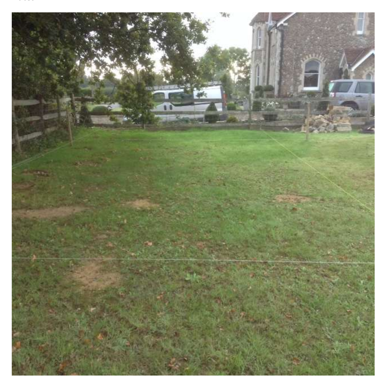
Plate 2. General view of site (looking east)